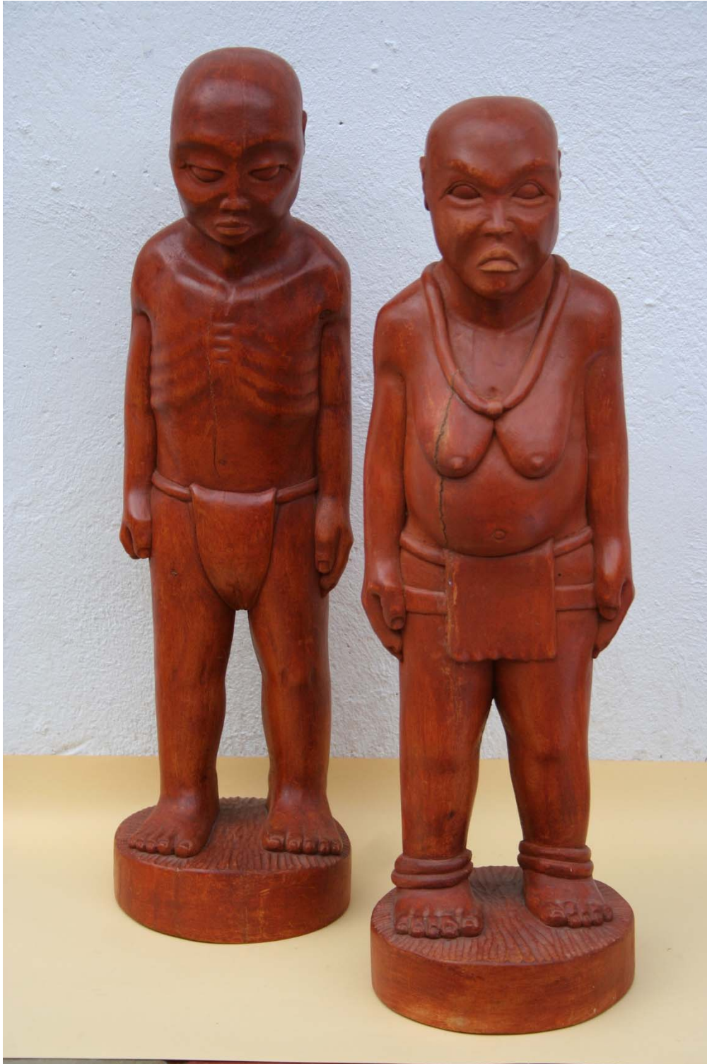
Illustration 2. Paired female and male carving, by Azwimphelele Magoro, 1996. Quinine tree, ochre ointment. H: 600mm. Author's collection.