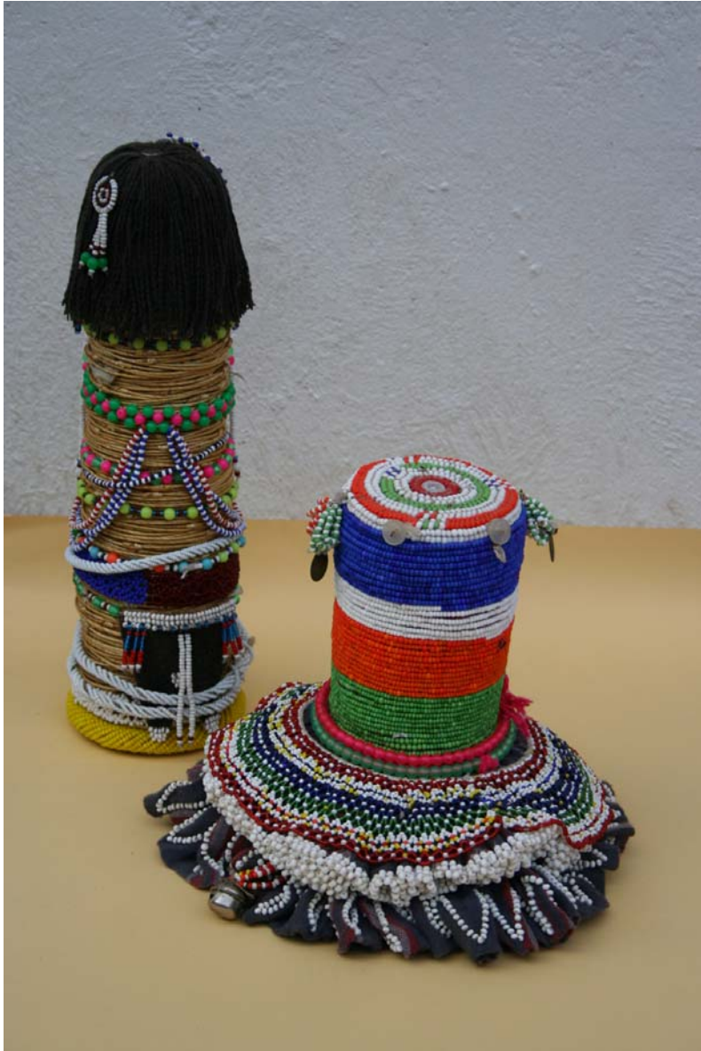
Illustration 3 (on the left). Gimwale Doll (Ntwane), 2004. Beads, grass, rope, animal hide. H: 300mm. Author's collection.